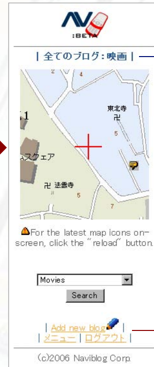
RESULTS MAP PAGE (click the blog icon)